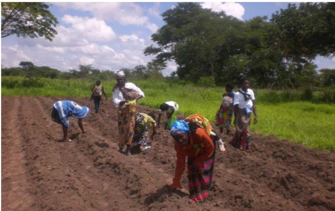
The care takers are planting soya beans.

This farming season we have planted 30 kg. of soya beans; each care taker was given a portion of land to plant and to take care of throughout the farming season. This was received with gladness as one care taker proudly said “it is our children who will be feeding on these soya beans so we need to contribute a little other than just waiting to receive all the time.” It is our hope that after May 2012 we will be able to have our own Soya beans.